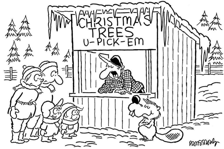
" JUST POINT OUT THE ONE YOU WANT TO BUDDY HERE, AND HE'LL DO THE REST ... "