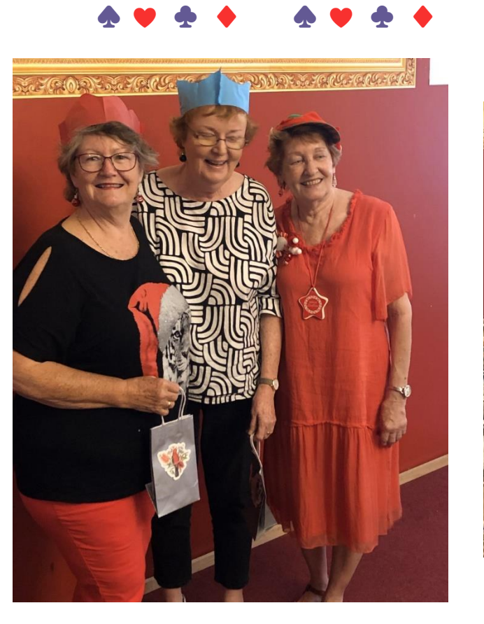
INGHAM CHRISTMAS PARTY