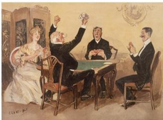
What has the Dealer Declared? by Leonard Raven-Hill (1932).